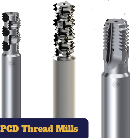
PCD Thread Mills

JBO's ability to combine state of the art PCD/CBN manufacturing with 35+ years of thread milling experience allows them to manufacture the highest quality diamond thread mills in the world.