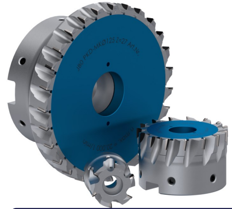
PCD-PF Face Milling Cutters

JBO's ability to combine state of the art PCD/CBN manufacturing with 35+ years of thread milling experience allows them to manufacture the highest quality diamond thread mills in the world.